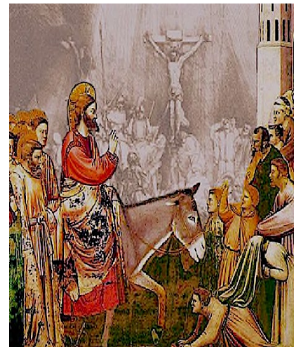
Those preceding him as well as those following kept crying out: "Hosanna! Blessed is he who comes in the name of the Lord!" (Gospel)

1st Reading: Isaiah 50: 4 - 7 Responsorial Psalm: My God, my God, why have you abandoned me? 2 nd Reading: Philippians 2: 6 - 11 Gospel: Mark 14: 1- 15: 47