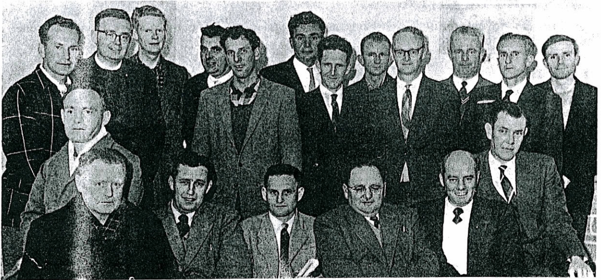
SOME OF THE MEN WHO DISCUSSED THE CANVASS PLAN